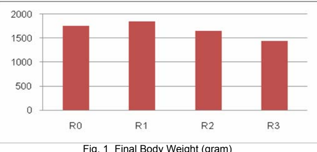
Fig. 1 Final Body Weight (gram)

The final body weight of broiler that feed with tuna fish silage is lower than fish meal, ever the processing didn't destroy the nutritional quality of the row materials [6], [12].