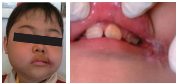
Figure 4. Day 60. (a) Moon face caused by corticosteroids therapy. (b) Healing lesion.

erythromycin, and metronidazole, intermediate to oxacilline, ceftriaxone dan cotrimoxazole. After this testing available, high dose antibiotic therapy was instituted to halt the spread of noma. Parenteral antibiotics were started. The drug dosages were adjusted according to the patient's age to prevent toxic effects. In addition, adequate hydration, correction of electrolytes and vitamin deficiencies with provision of sufficient nutritional support were also given by nutritionist. Local debridement of necrotic tissue was still performed throughout the course of the treatment.