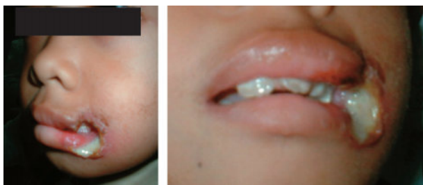
Figure 2. Day 7. Discharge of pus from the corner of the mouth.

On December, 30 th , 2007 (11 days later), the patient came to the hospital for medical control. The pain of the mouth has decreased. There was no improvement healing of the noma. The necrotizing tissue on his mouth was enlarging. There was discharge of pus from the corner of the mouth (Figure 2). The result of culture testing showed Fusobacterium necrophorum , Staphylococcus aureus , and Klasiella . At this time, a definitive diagnosis of noma was made. The patient did not consume the medicine regularly because he didn't feel convenient. The patient was referred again to microbiology laboratory for further examination (sensitivity test) because the previous treatment did not show recovery. Hydrogen peroxide, saline, and 0.2% chlorhexidine were applied again to the wound. The dressing was also done to remove sloughed tissue. The same oral antibiotics and nutritional supplements were still given. At that day, the patient was admitted to the hospital under paediatrician and allergy and immunology specialist for evaluation of SLE disease because his condition was decreasing. He was also referred to Department of Nutrition for malnutrition evaluation. Parenteral fluid supplement replacement was also provided to maintain electrolyte balance.