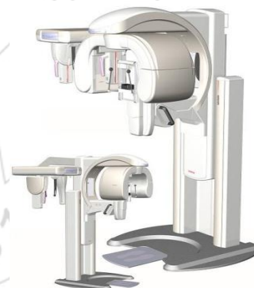
Figure 2: Plane type of X-ray type Picasso Trio; brand Epx-Impla, type B applied part Impl, serial number 0165906; production of Vatech & E-woo Korea 5 .

Panoramic Radiography photo used was taken with a digital x-ray type of Picasso Trio; EPX-Impla brand, type B applied part Impl, serial number 0165906; production Vatech & E-woo of Korea. Processor used to process data is a computer unit Axio with specifications Pentium 4, 4G memory. Software used is EasyDent 4 Viewer Program of Vatech & E-woo of Korea 5 .