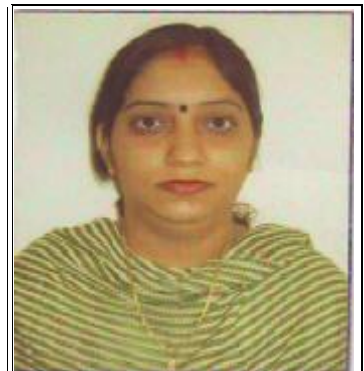
Research Article TEACHING ENGLISH IN A MULTILINGUAL AND MULTICULTURAL COUNTRY LIKE INDIA IN THE GLOBALIZED CONTEXT