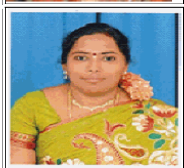
Research Article THEMES IN THE SELECT NOVELS OF MULKRAJ ANAND