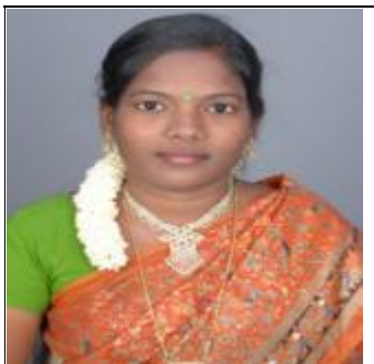
Research Article GATES OF LITERATURE: ROLE OF LITERATURE IN INSTIGATING A SOCIAL CHANGE