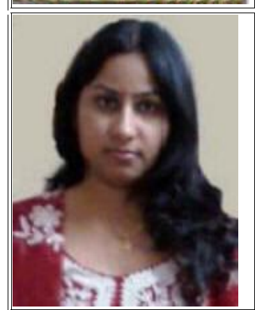
Research Article ROLAND BARTHES'S ESSAY "THE DEATH OF THE AUTHOR" - CRITICAL EVALUATION

Vol.1.Issue 4.; 2013 pp 94-97 Download PDF (FREE)