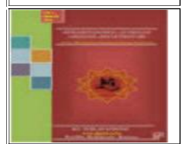
Research Article THE IMPACT OF WOMEN ON HEMINGWAY

PhD Scholar, Dept of English & Comp. Lit., M K University, Madurai-21 Vol.1.Issue 4.; 2013 pp 102-107 Download PDF (FREE)